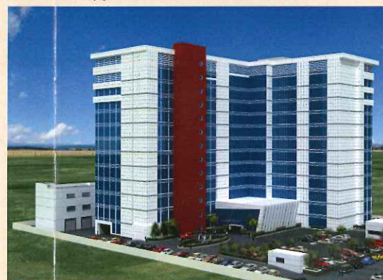
TICEL BIO PARK-II

Biotechnology Core Instrumentation Facility (BTCIF) established jointly by TICEL and Department of Biotechnology, Gol for providing scientific supports at a cost of Rs.193 millions.